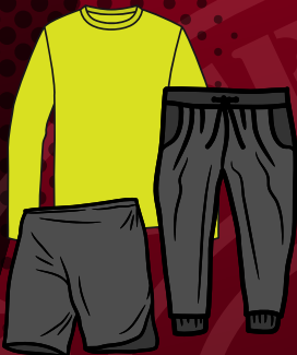
LONG SLEEVED SHIRT & SHORTS OR FULL LENGTH PANTS