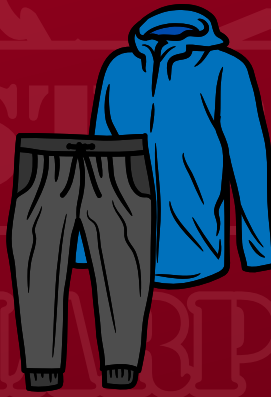
SWEATSHIRT OR FLEECE & PANTS