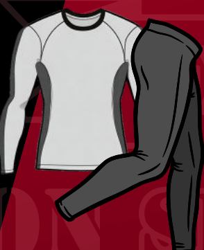
LONG SLEEVED SHIRT & TIGHTS (OPTIONAL)