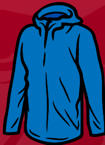
SWEATSHIRT OR FLEECE