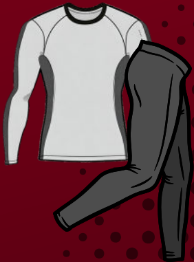
LONG SLEEVED SHIRT & TIGHTS