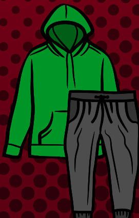
FLEECE & PANTS