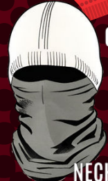
NECK GATOR OR BALACLAVA