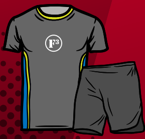
SHORT SLEEVED SHIRT & SHORTS