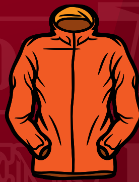
LIGHT WEIGHT JACKET (WINDY & WET CONDITIONS)