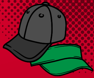
HAT OR SWEAT BAND