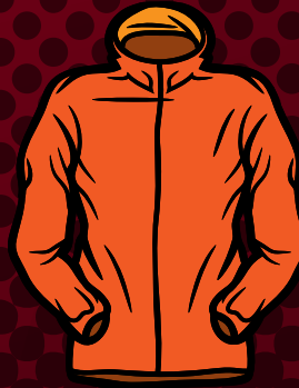
LIGHT WEIGHT JACKET (WINDY & WET CONDITIONS)