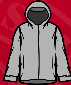
RAIN JACKET SHELL (FOR WET CONDITIONS)