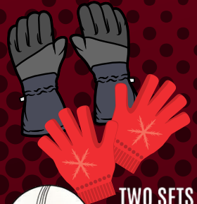
TWO SETS OF GLOVES OR HAND WARMERS