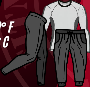
LONG SLEEVED SHIRT & PANTS OR TIGHTS