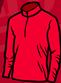
LIGHT SWEATSHIRT (OPTIONAL)